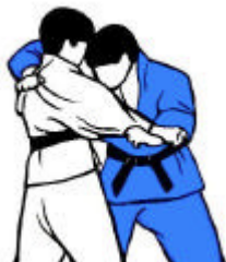
1. Any alternative to standard grip