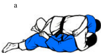
1. Ouchi-gari into Tate-shiho-gatame