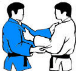
1. Standard grip