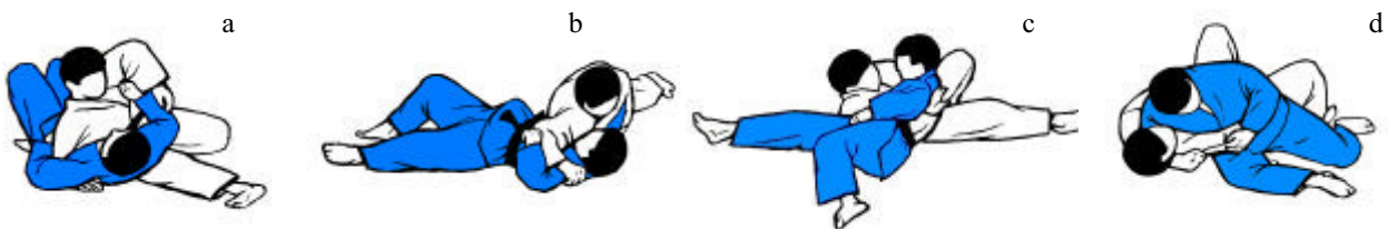
2. Kuzure-kesa-gatame escape using "sit-and-push"